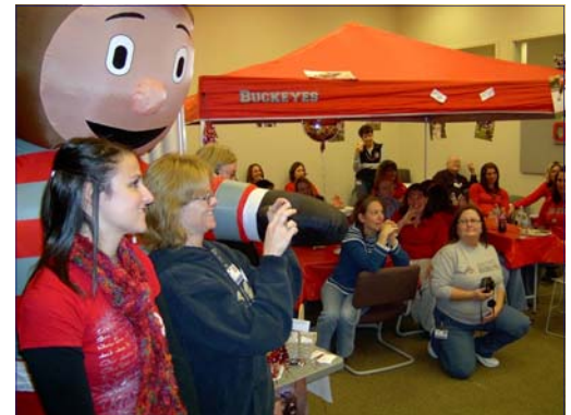
Employees at the Union County Department of Job & Family Services had a United Way/Buckeyes tailgate party this fall before the Iowa game. Union County employees combined to give a whopping $28,528 this year!

The donations and corporate matches raised during these workplace campaigns account for roughly 90% of United Way's annual income. More individuals and more businesses choose to make their charitable impact through United Way than any other local non-profit organization. We thank you for entrusting your hard-earned dollars with us. We could not do our work without your support.