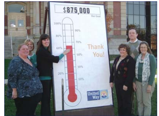
Honda of America accounts for 25% of United Way's campaign total. Associates and corporate matching exceeded $200,000 for the 10th straight year.